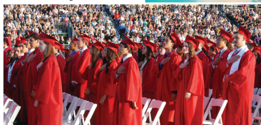
John Burroughs High graduates pledge