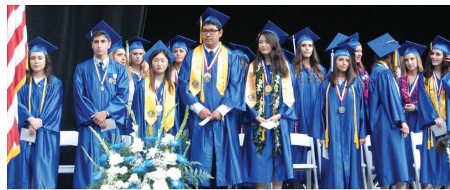
The Top Ten of Burbank High

Graduation ceremonies each year bring us together in shared pride and gratitude. Graduation gives us the opportunities to gather, connect, reflect and celebrate. Speakers at this year's ceremonies at Burbank public high schools continue the traditions and exemplified outstanding achievements in their school careers.