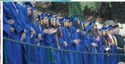
Burbank High graduates

teachers, but called Burroughs their "home". She promises to come back with a cure for senioritis when she is a doctor. She hopes to be remembered for standing up for something greater than self, saying, "Don't let the haters stop you from doin' your thang!"